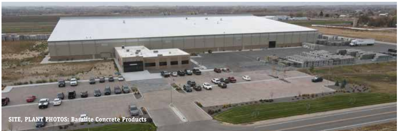
SITE, PLANT PHOTOS: Basalite Concrete Products

The Basalite Colorado hardscaping plan phase one entailed installation of 50,000 sq. ft. of Spec Pave 100 permeable pavers across parking area for 200-plus cars. Extensive landscaping and retention pond excavation will follow in future phases. An apron on the east, north and west (rear, above) elevation affords expansive storage for Architectural and Landscape line output. Up to 90 feet at its widest points, the concrete service pavement provides designated lanes for dump, tanker and tractor trailer drivers.